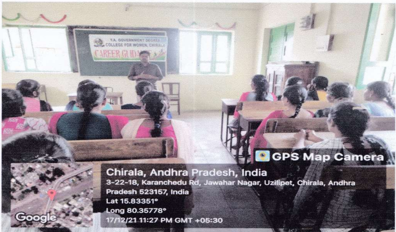
Career counseling program to the students in software sector

After conducting this Programme students discover their Passion identity one's Life purpose and to build a game plan for life.